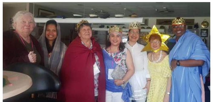
The handmaids Advent celebration

Merry Christmas! From the Handmaids of the Lord