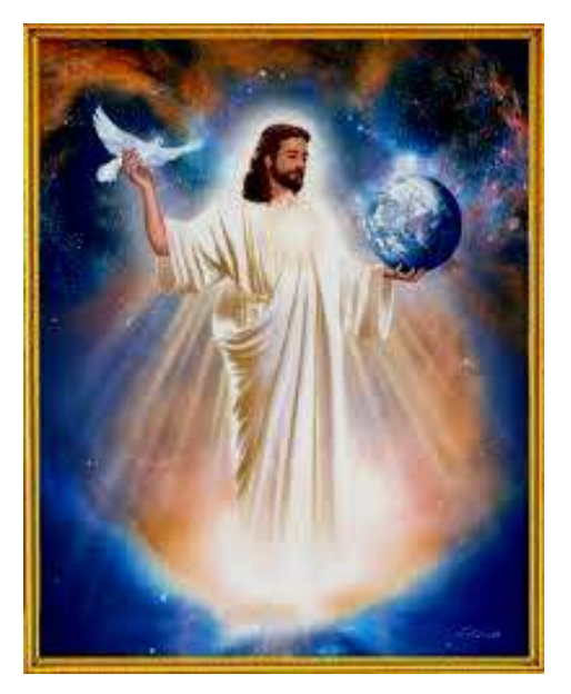
NATSICC APPEAL A Special Collection will be taken up This Weekend , to support over 120,000 Aboriginal and Torres Strait Islander Catholics in Australia.

Readings for 16th July 2017 1st Reading :Is 55:10-11 2nd Reading :Romans 8:18-23 Gospel :Matthew 13:1-9